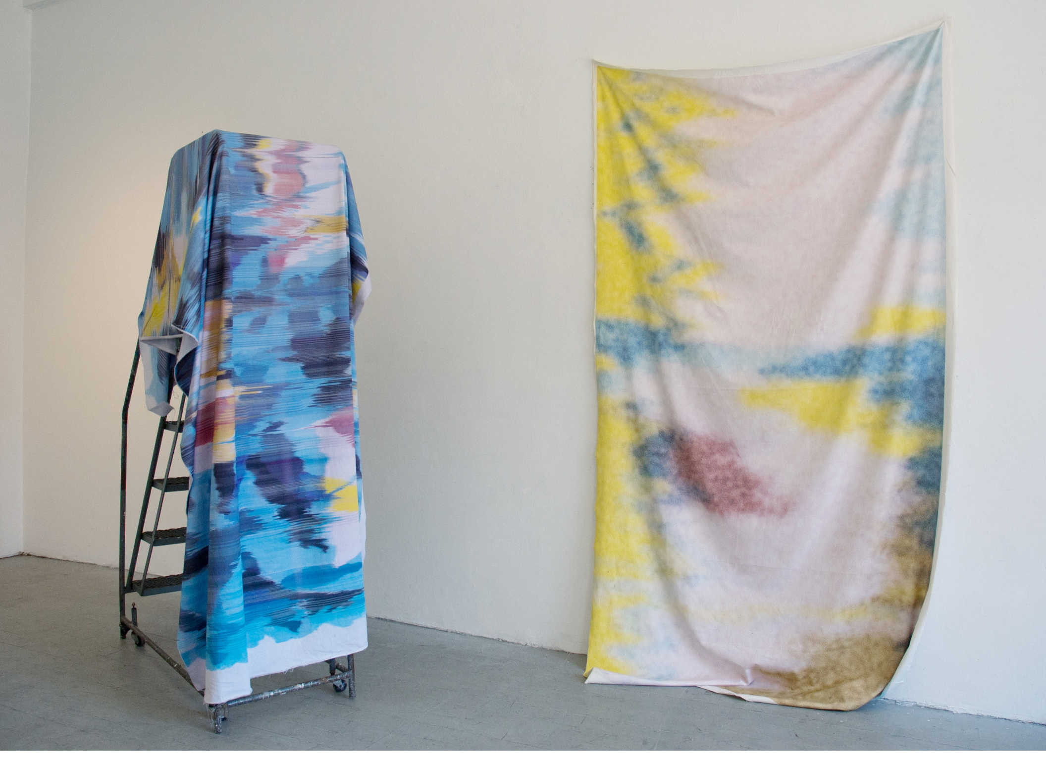
Lengths for Interior Decoration and Furnishing- Digitally printed fiber reactive dye on cotton twill.