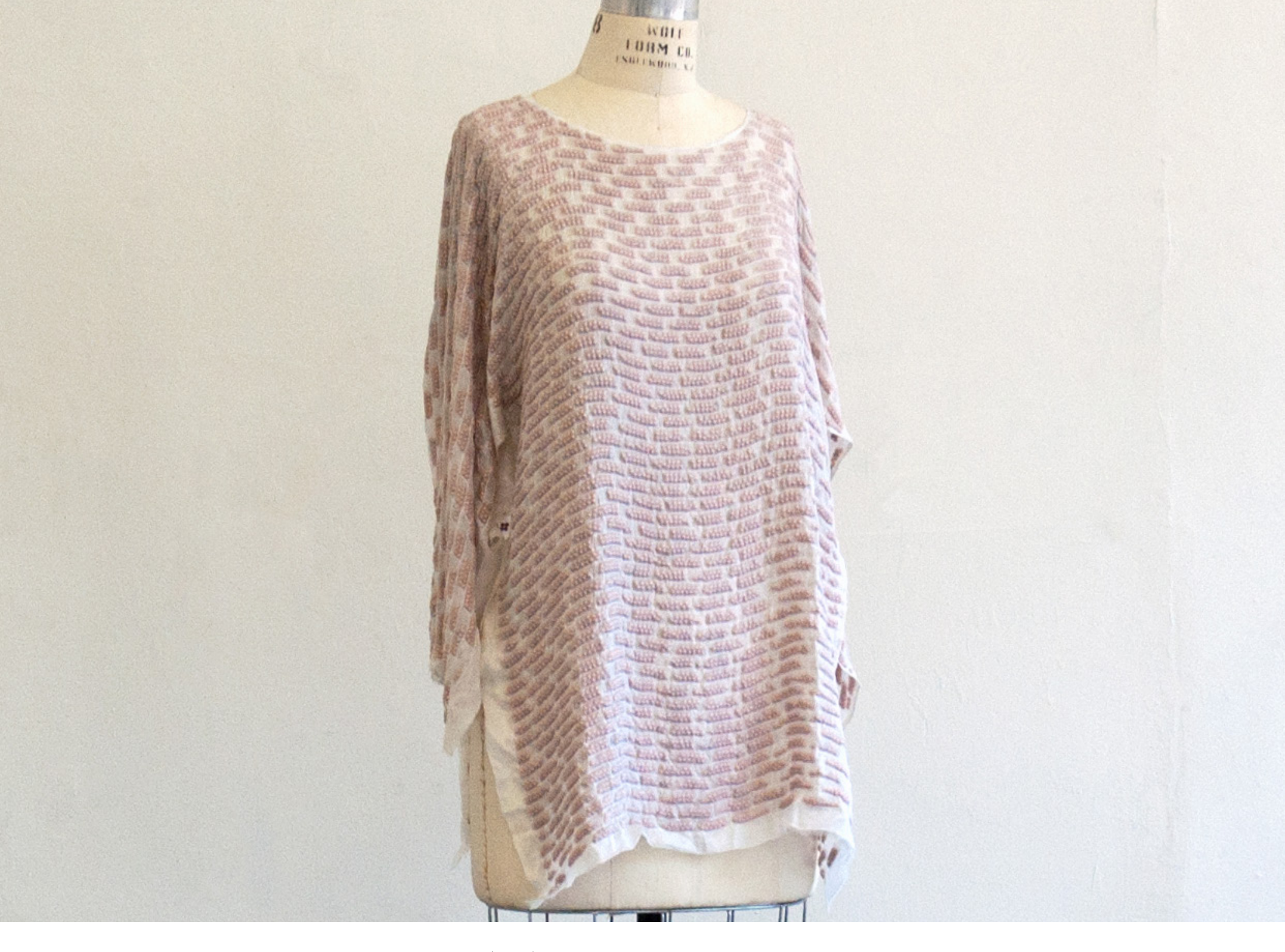
Weighted Silk (16 lbs)- Silk Organza, Copper BBs, Polyester thread