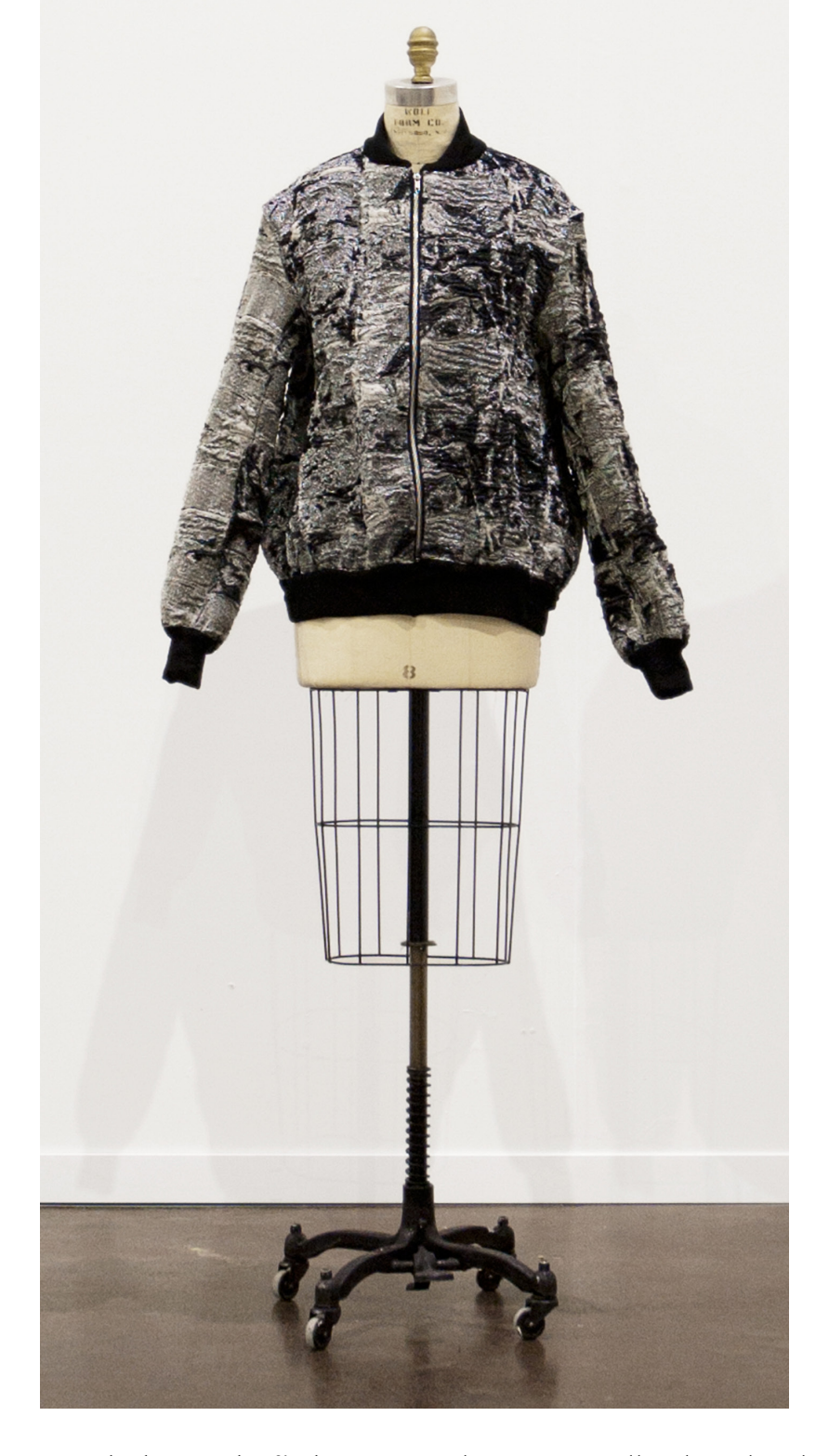
Emergency Blanket Bomber Jacket- Jacquard woven metallic thread and wool