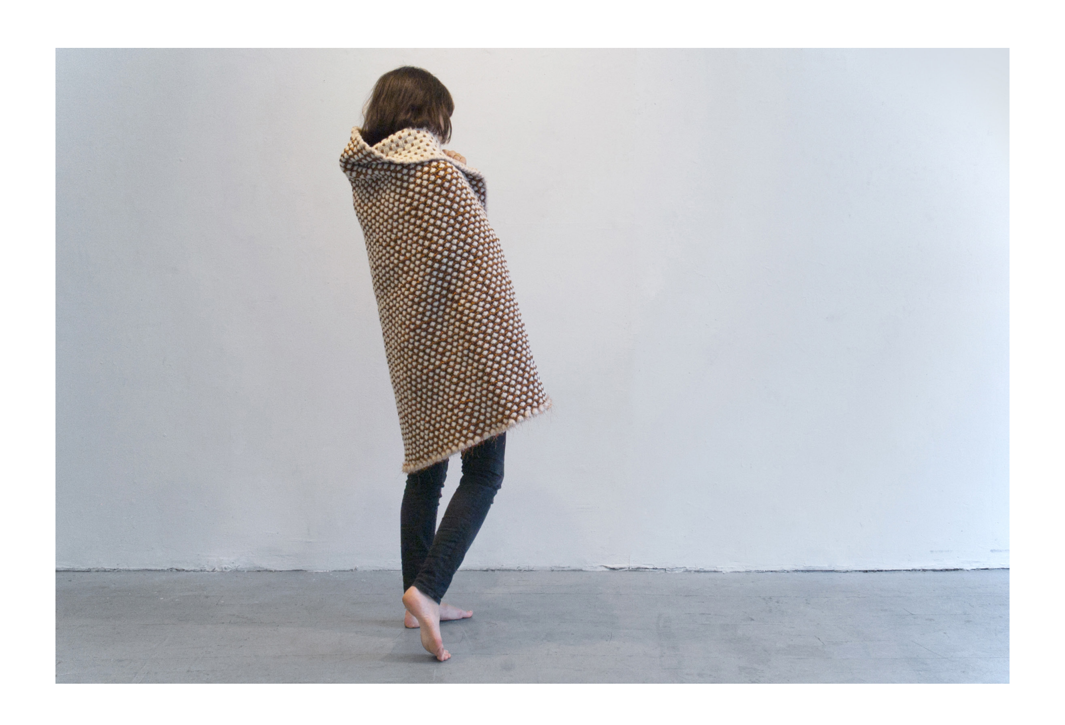
Security Blanket-Jacquard woven copper and wool